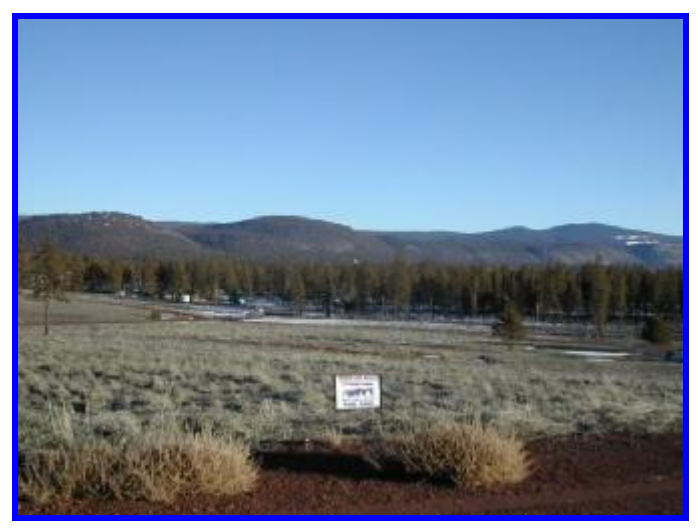
This lot has an unobstructed view to the south toward Klamath Falls. Only $7,900.