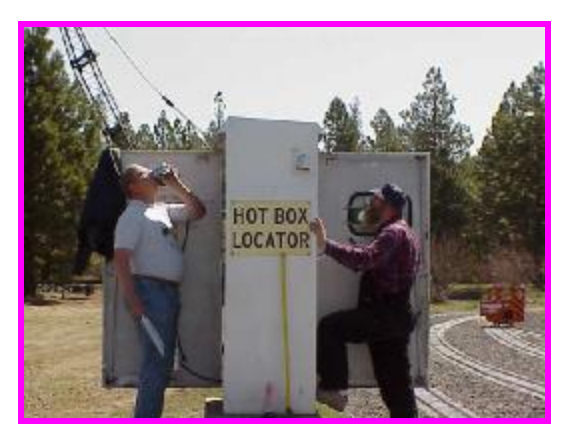
Or, one guy is working and the other guy is drinking on the job, but when they got all through it worked! What a system!