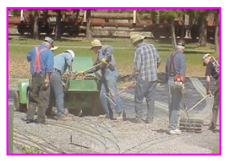
Then you attack the poor guy with an entire regiment!