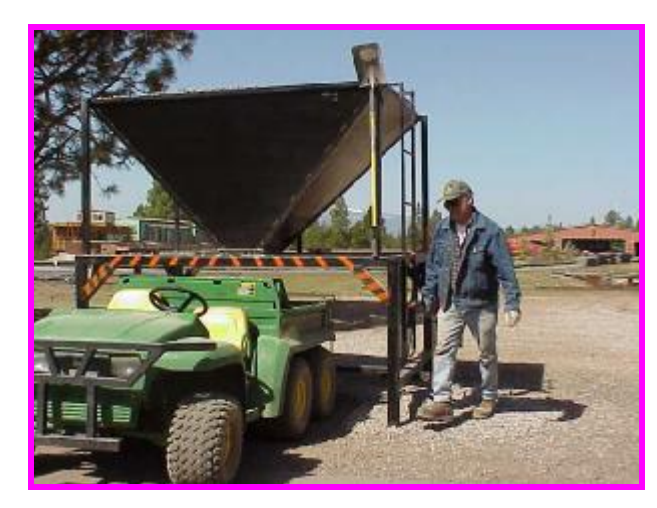
Kitsap has these great 'work' systems, as an example, you send ONE guy after some ballast then . . . .