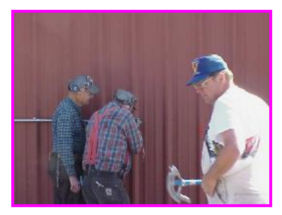
Or their other system works something like this, keep working or I'll get a bigger club! Or something like that!