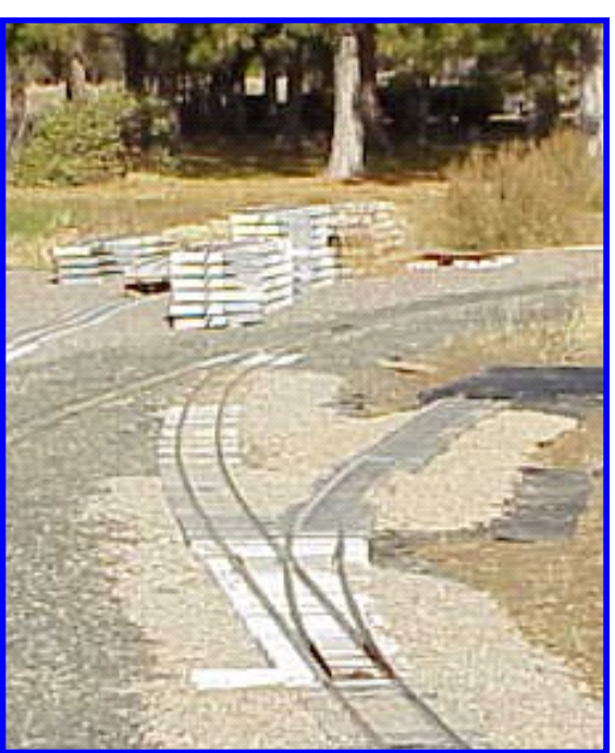
A new entrance to Containerville!