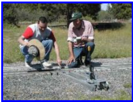
OK, one more time, what part is the points?

Did I mention the thunder and lightning? Here's proof of the lightning! Now I wonder if the guys in those tents know?