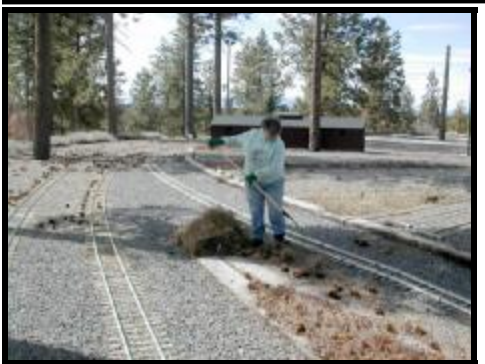
PHOTO GALLERY - Preseason happenings at the Mountain! And yes the ground is still wet!

The good news is some of the snow is gone, the bad news is Joyce Kludt found the pine needles and pine cones that were hiding underneath the snow!