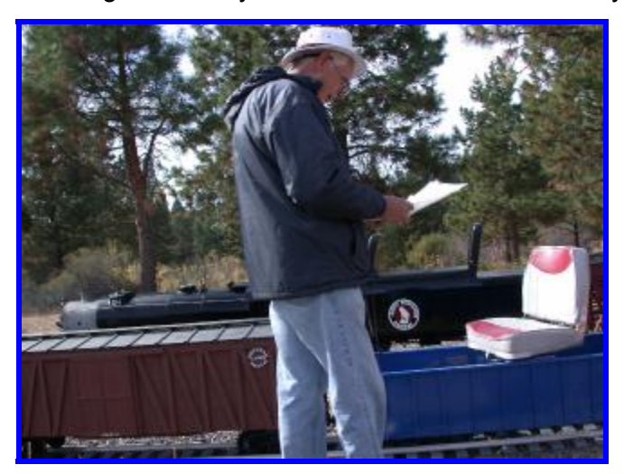
First comes the paperwork, then a little train ride, and then we spot some cars, then . . . .