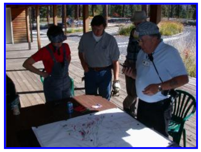
The dispatcher was very busy keeping track of the fun!