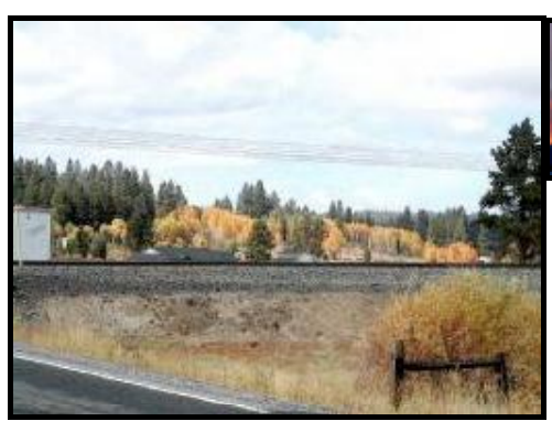
Home sites amongst the aspens with some river view, north of Chiloquin.