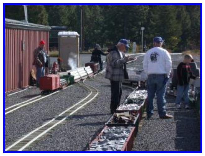
Mornings are always fun and crowded. It's the only time we are all gathered together at the same spot.