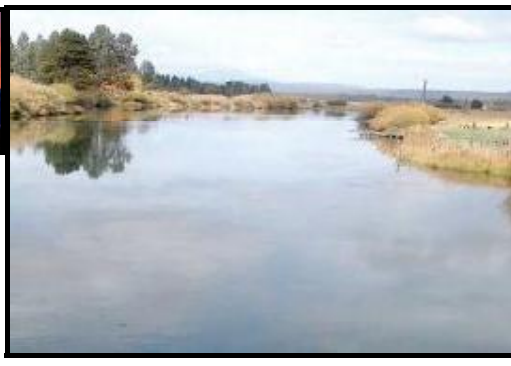
The <u>Williamson River</u>, a Class 1 fishing stream, with access to fish the riverfront!!

SHARON BREEN YOUR REAL ESTATE AGENT 541-891-2040