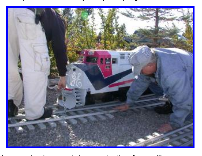
We even had a great demonstration fo rerailing a large locomotive during the meet.