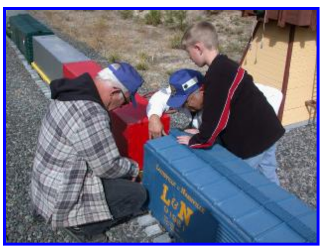
Safety cables had to be connected to move a train.