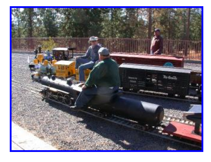
Did I mention we had some steamers at this meet! There was big ones, little ones, and some in between.