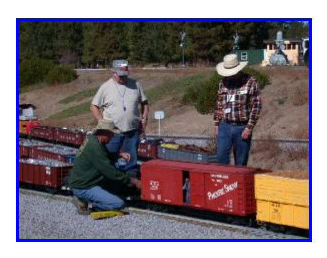
The theme of the day was picking up and spotting cars at all the spurs on Train Mountain, Great Fun!