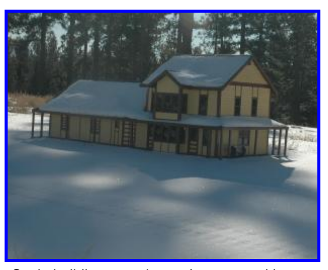
Scale buildings require scale snow and it sure looked awesome as we made our daily tours around the layout. We plowed a little more each day.