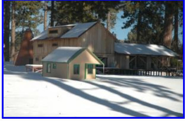
I always love pictures of Youngstown, especially during the winter and this years crop is no exception. A little mother nature sure goes a long way towards completing this great winter scene!