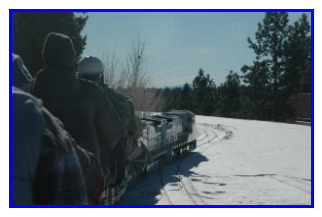
Not much snow but a lot of enthusiasm, fresh air (chilled of course) and plenty of jackets, scarves, hats, gloves, etc.