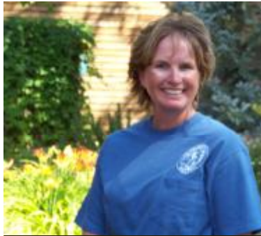
New Logo Pocket Tees