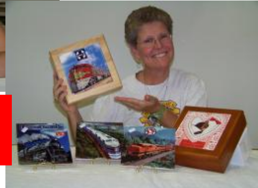
Custom Ceramic tiles and wooden boxes