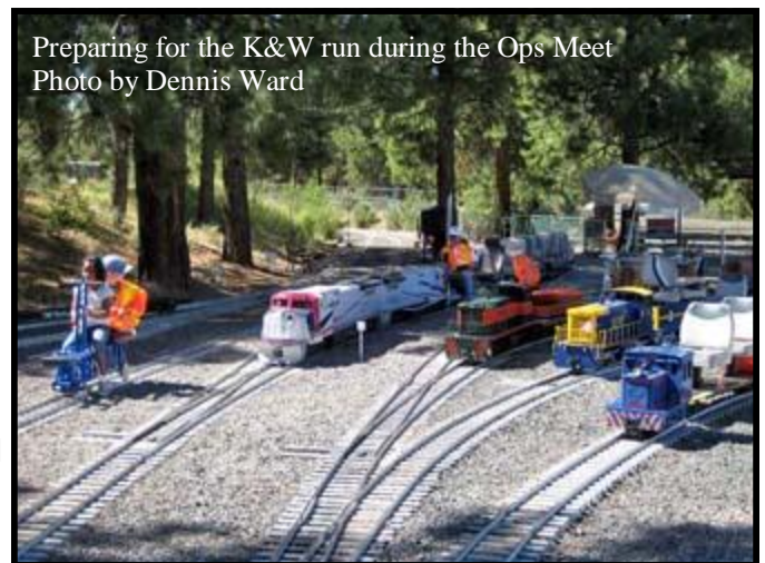
Preparing for the K&W run during the Ops Meet