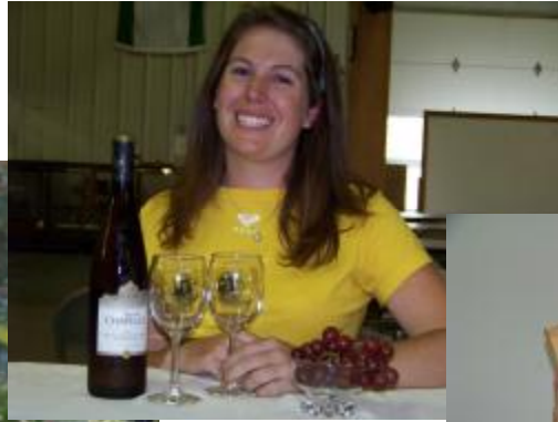
Logo Wine Glasses