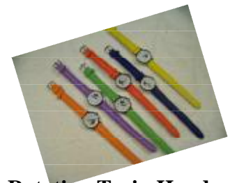
Rotating Train Hand Watches $11