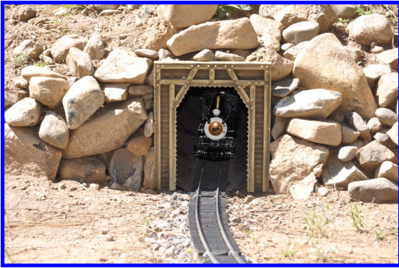
Here are two more pix from Midway Garden Railroad at Train Mountain