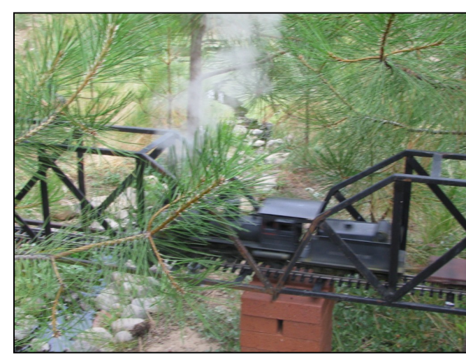
···and Puff Puffi