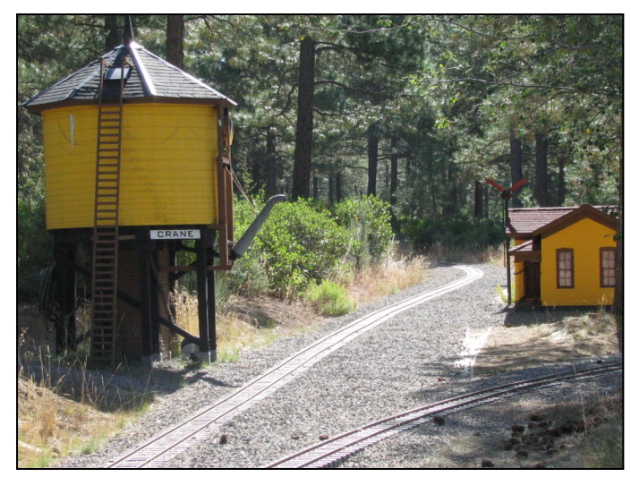
New Addition To Crane Siding!