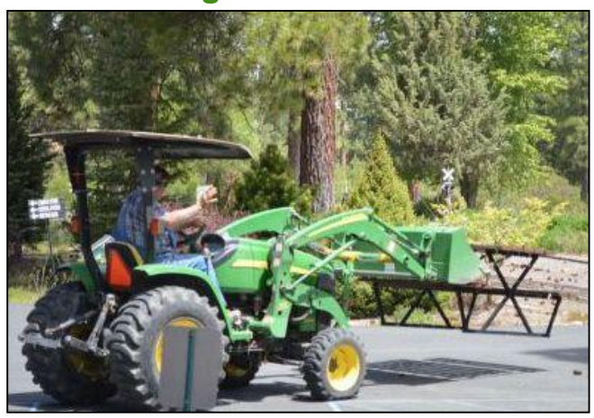
The Mountain Gazette