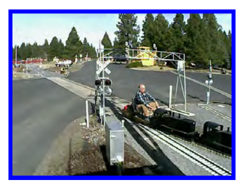
The Mountain Gazette