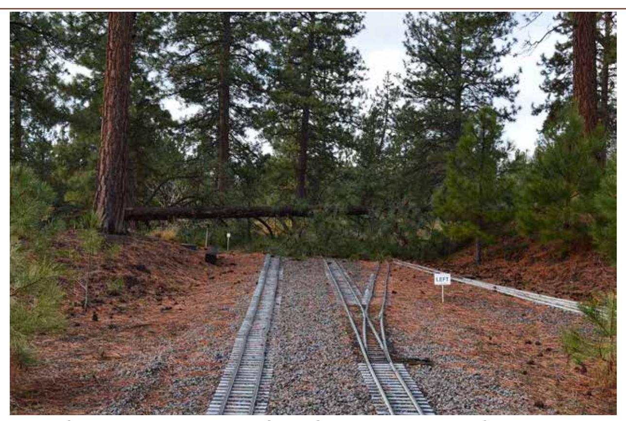
A few trees are down on the South Side, and at the time of assembling this Gazette no one has yet been to the North Side.