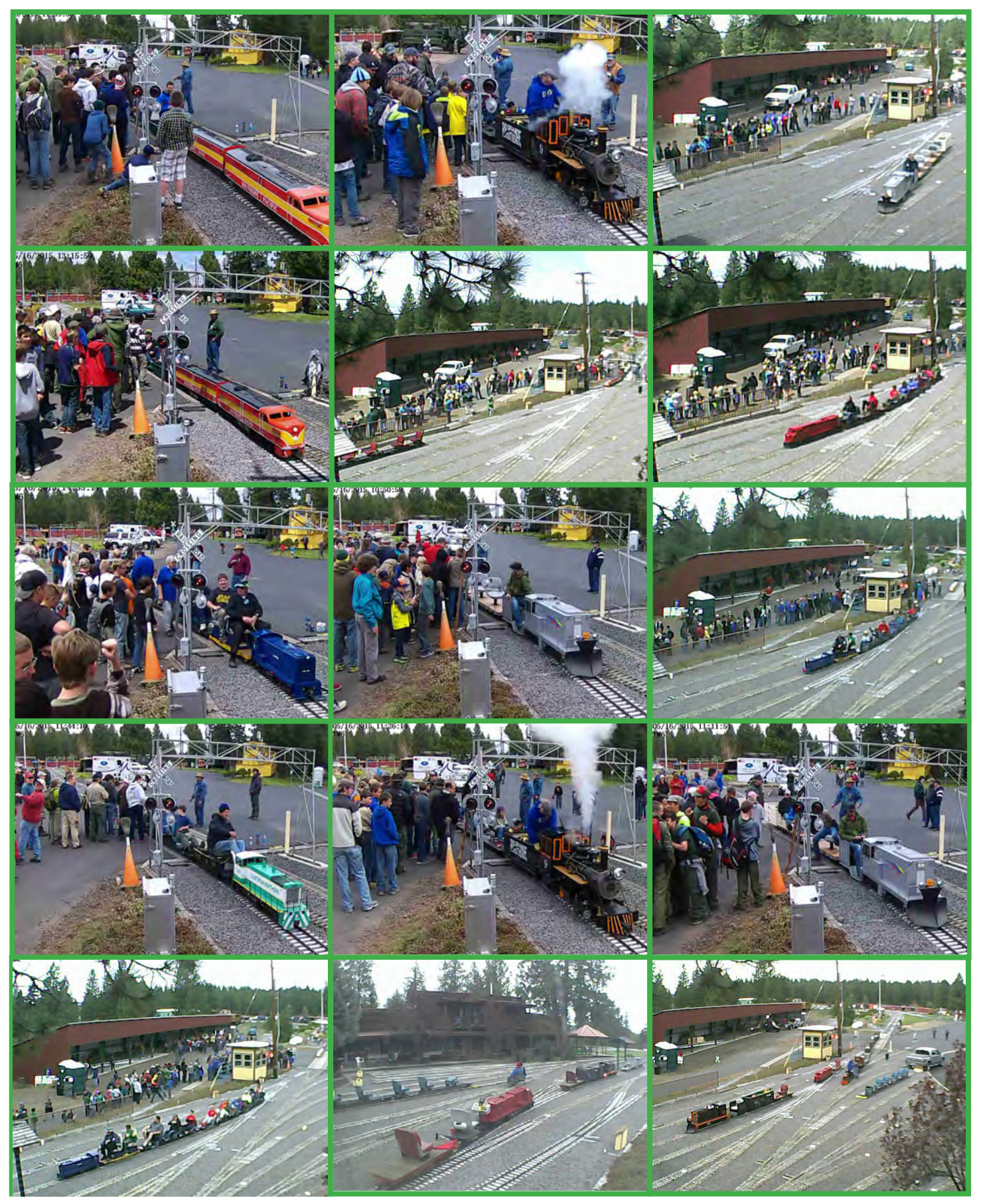
The Mountain Gazette Page 22 May 2015

Register for the Triennial Meet now!! Please Use the Online App to Register or Join-- http://tmrrmembers.org