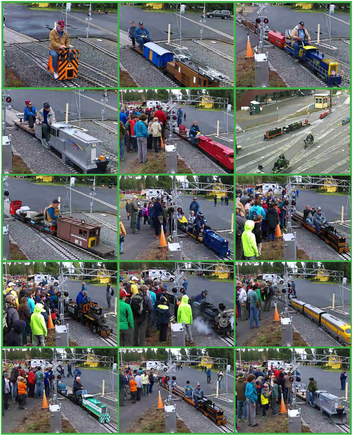
The Mountain Gazette Page 21 May 2015